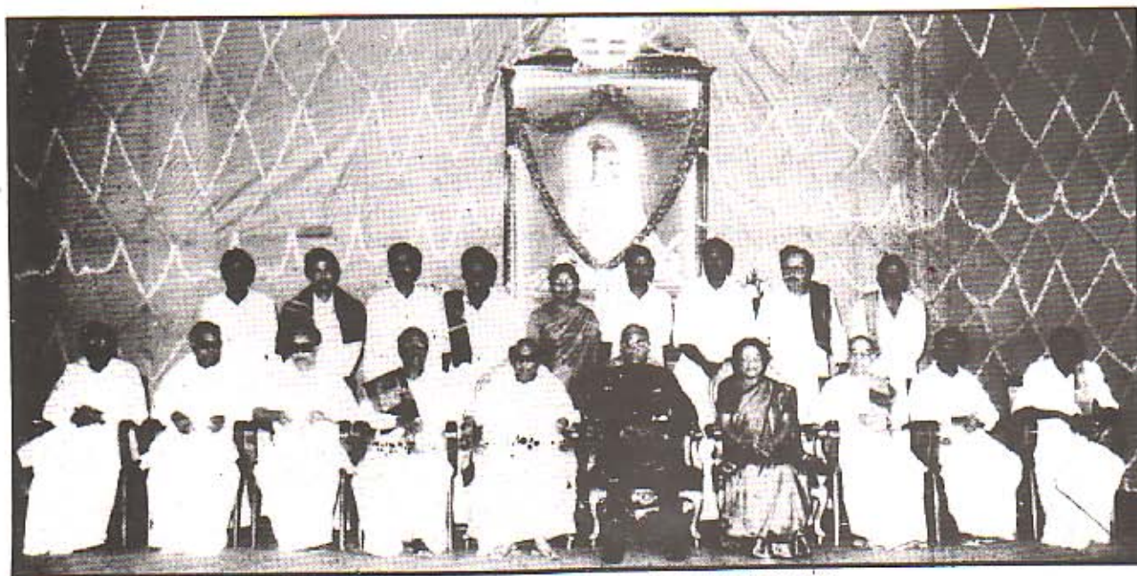
THE TAMIL NADU CABINET

★ FOR RAJIV, SOUTH IS ALL GONE, WILL NORTH FOLLOW