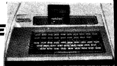
(PHILIPS VIDEOPAC G7000)

We specialise in mail orders. Overseas customers are welcome. Special discount for large orders.